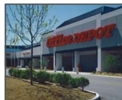
13 Southern Plaza Indianapolis, Indiana