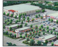
4 Brywood Centre Kansas City, Missouri