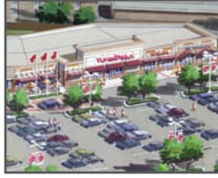
7 Oak Park Plaza Blaine, Minnesota