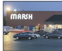
14 Shadeland Station Indianapolis, Indiana