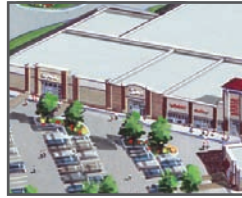
8 Burnsville Market Burnsville, Minnesota