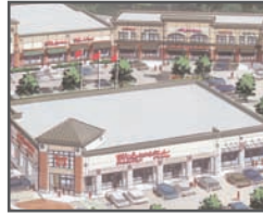
3 Cherokee South Plaza Overland Park, Kansas