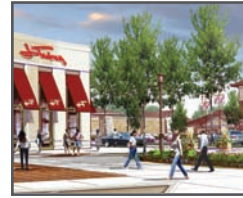
9 Countryside Center Yorkville, Illinois