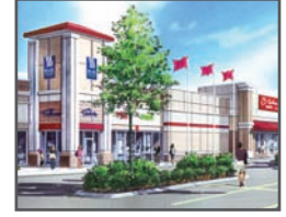
5 Blue Springs Market Blue Springs, Missouri