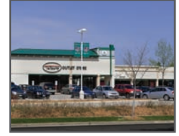
10 Village Green Shopping Center Park Ridge, Illinois