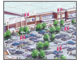
15 The Crossings at Four Corners Smyrna, Georgia