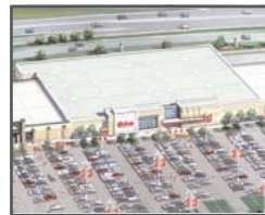
16 Salem Gate Conyers, Georgia