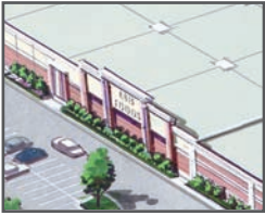
6 Fridley Market Fridley, Minnesota