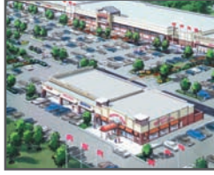
2 Ten Quivira Plaza Shawnee, Kansas