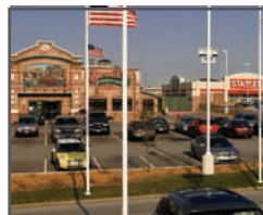
12 Century Plaza Merrillville, Indiana