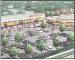
1 Devonshire Village Olathe, Kansas