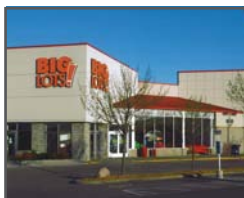
11 River West Center Milwaukee, Wisconsin